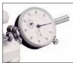
Q485 Dial Indicator for ultra fine flow adjustment Price: (pg 28 for more info)